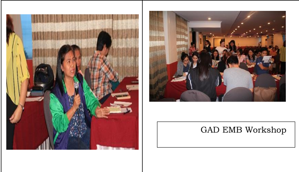
GAD EMB Workshop

c. The second part of the training give emphasis in mainstreaming of GAD on the project, programs and activities of EMB using the checklist. The Concept of Harmonized Gender & Development Guidelines (HGDG) is the highlight on this training. The purpose of HGDG is to integrate GENDER in the development and planning process of EMB programs, projects and activities. In addition, this will help to achieve gender equality and empower women contribution and participation in the planning process of the projects and programs of EMB. Workshop in using/filling up the EMB Checklist is one of the activity participated by the Section /Division Head of EMB 4A. (Pls. see attached filled up checklist).