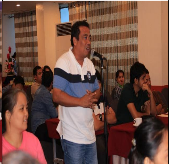
EMB personnel GAD workshop