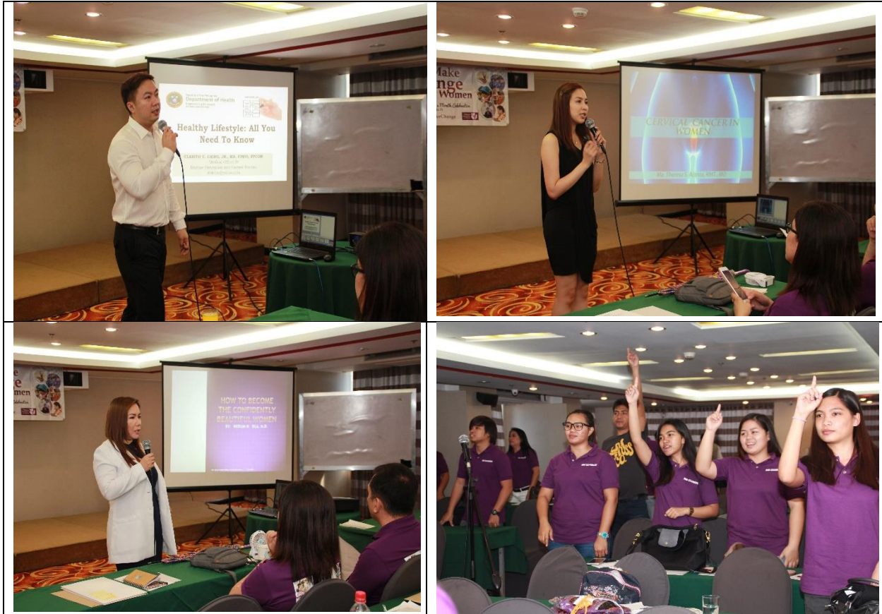
Seminar during Women’s Month Celebration, March 23, 2017

Women’s concerns included in the Environmental Events Celebration. In support to these Events EMB personnel, both men and women attended/participated the following activities: